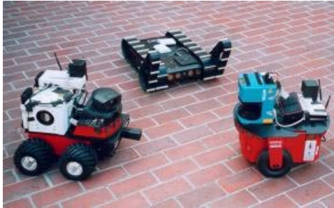
Figure 2: A subset of the robot testbeds used in our research.

which is later used by both robots if they need to establish communication again. If the robots fall out of communication range again, they backtrack to the last stored rendezvous location and wait for contact.